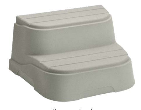
Shown in Sand