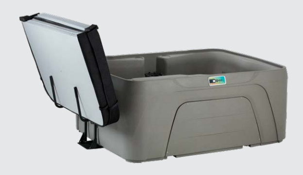
Enamor shown in Taupe and RX cover lifter