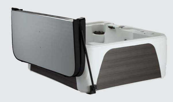
Entice Premier shown with Arctic White shell and Charcoal cabinet, and Low Mount cover lifter