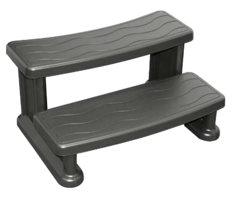
Shown in Charcoal