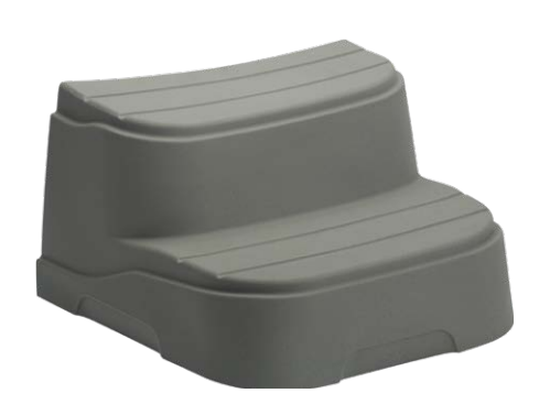
Shown in Taupe