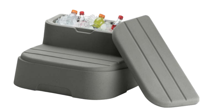
Shown in Taupe