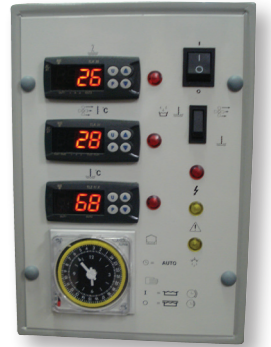
Air and water LPHW control panel