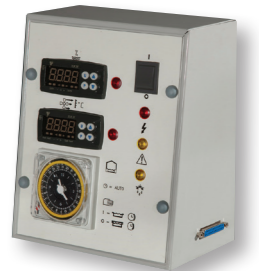
Control panel kit can be mounted up to 20 metres away (additional cable required).