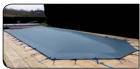
*according to our general warranty terms delivered with the cover.