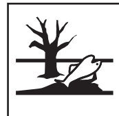
5 Dangerous for the environment