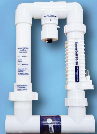
Patented Bypass Manifold

* Only valid for residential applications