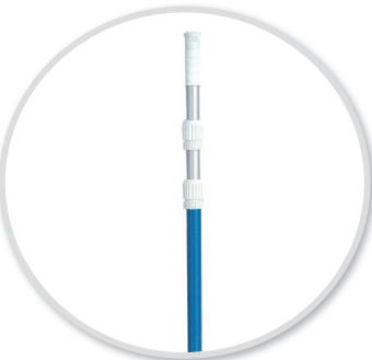
STANDARD VAC POLE