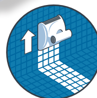
Floor & Wall Cleaning