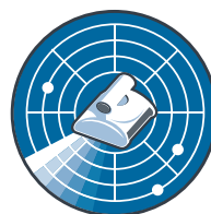
CleverClean scanning system