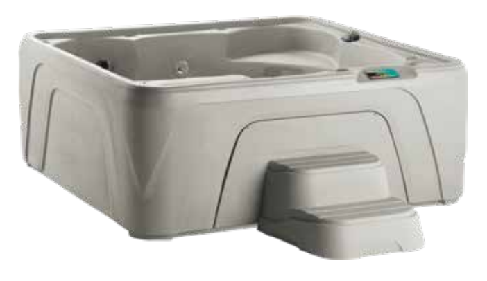
Entice shown in Sand with built-in ice bucket