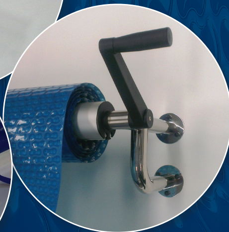
Eco - Fixed-wall