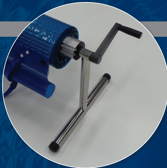
Eco - Fixed-floor

The Eco-Reel is available in three styles - mobile, fixed-floor and fixed-wall - each offering three size ranges for pools from 2.6m to 5.7m wide and is suitable for bubble covers up to 12m in length. However, the optimum operational capacity of the reel system is surpassed when a cover exceeds 50m 2 . Each system includes a crank handle, a slide-lock anti-unwind system and fully adjustable cover-to-roller strap kit as standard.