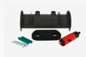
Cell installation kit for 50-mm and 63-mm hoses