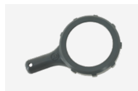
Locking ring wrench