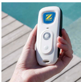
Motion sensing remote Responsive cleaning control in the palm of your hand