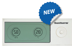
DRC1 remote control

A newly developed remote control allows reading and setting of relative humidity and temperature, alarms and service information.