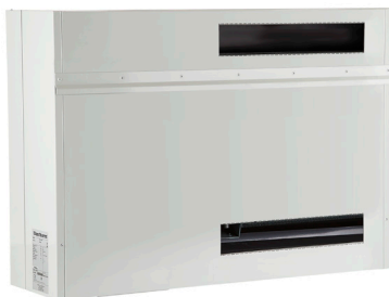
CDP-T through the wall version