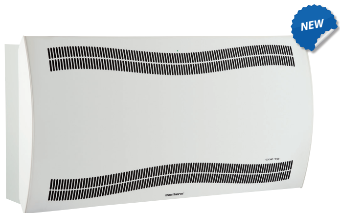
CDP pool room version – wall mounted or floor standing