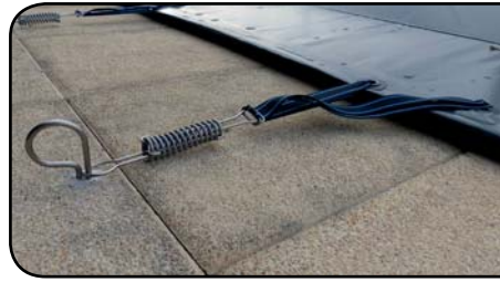
Stainless steel strap and spring