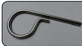
Stainless steel P-Shaped PEG