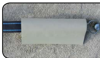
PVC-protection for Dynamometer springs

Swimming pool safety cover designed to prevent access to the pool for children under 5 years of age.